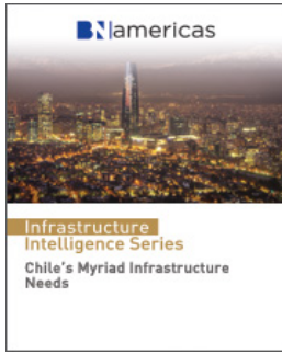
Chile's Myriad Infraestructure Needs